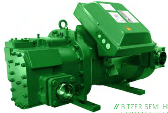
// BITZER SEMI-HERMETIC EXPANDER/GENERATOR