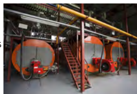
Boilers & Process Heat