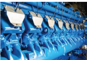
Power Generation Stationary Engines Combined Heat & Power

While ElectraTherm specializes in the below industries, any fluid heat source up to 150°C or gaseous heat source over 150°C is a potential fit for our heat to power ORC solutions.