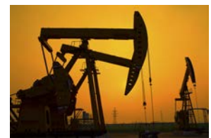
Co-produced Fluids Oil & Gas Micro Geothermal