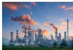
Industrial Waste Heat