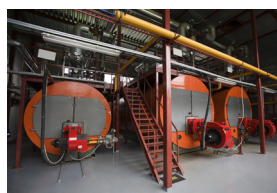
Boilers & Process Heat