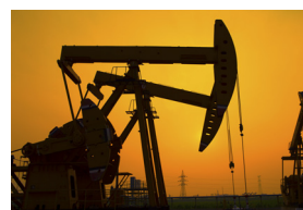
Oil & Gas, Geothermal